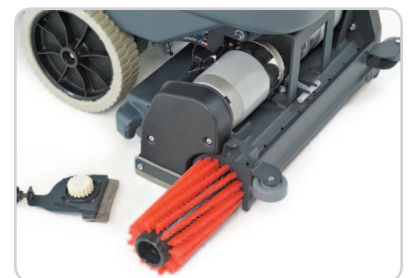
Tools-free removable brushes can be easily changed.