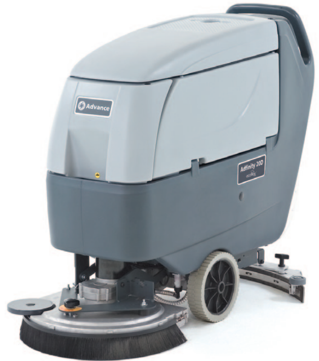
Adfinity X20D pictured