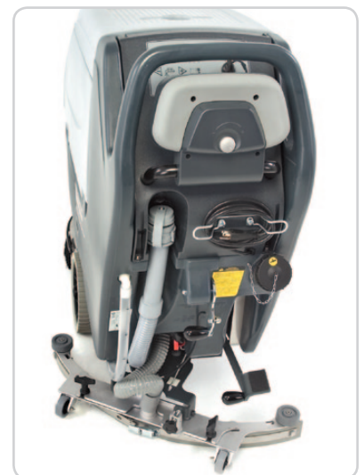
Easy access rear-port features include the solution tank fill, a large recovery drain hose with pinch-flow regulation, and the solution drain hose which also functions as a solution level indicator.