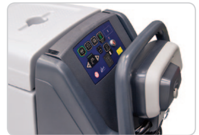
A wrap-around safe paddle system makes it easier to control and maneuver the machine.