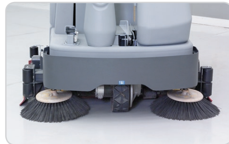
Retractable side brooms on cylindrical models sweep debris away from pallets and walls.