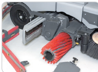
A large, non-corrosive hopper on cylindrical models allows for maximum debris capacity without overflow and slides out for easy debris disposal.