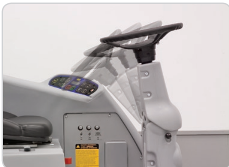
Ergonomic command compartment with tilt steering allows for easy boarding.