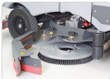
A large range of interchangeable disc and cylindrical scrub deck options provide the right tools for the specific job.

The Condor with EcoFlex System delivers the flexibility to clean your floors more efficiently. By using a system that cleans like you do, you'll reduce your cost to clean and create a more sustainable cleaning program.