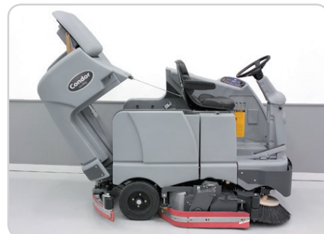
No tools are needed to lift off recovery tank for extra access to batteries and squeegee assembly.