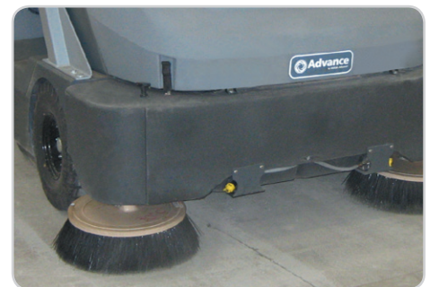
Sweeping with DustGuard™