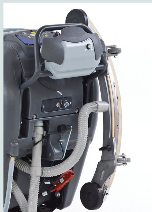
A built-in squeegee hanger makes transport easier and reduces trip and fall accidents.