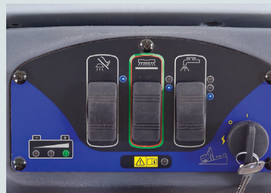
The SC750 ST / SC800 ST – provides simple operation and robust scrubbing controls.

For use on extreme soil levels (10% of scrubbing applications)