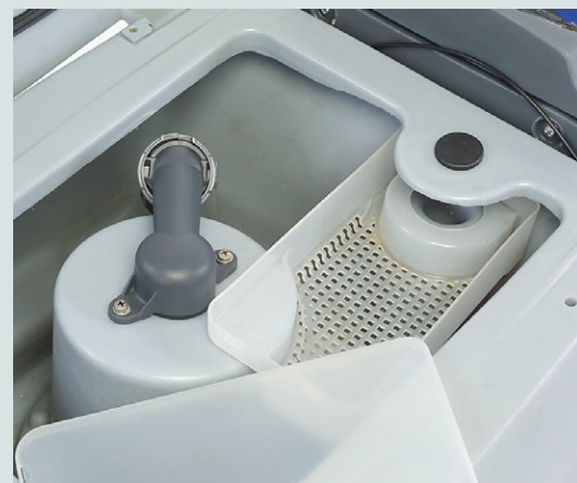
An integrated debris catch cage traps and collects drain clogging debris.