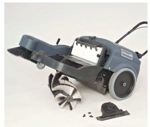
Tools-free removal of brooms and hopper makes for easy maintenance.