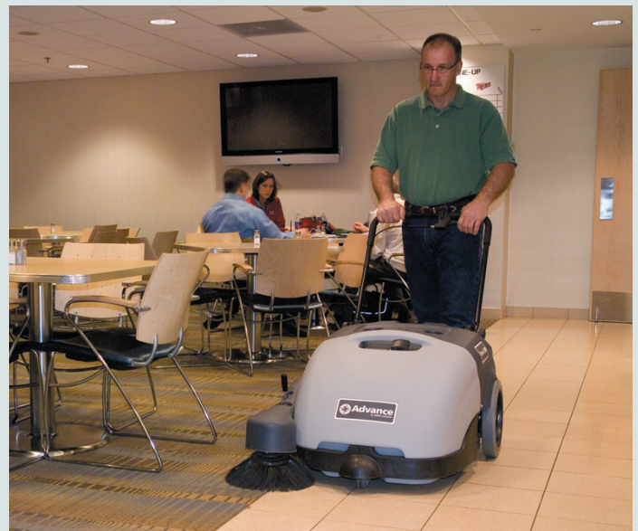
Terra® 28B easily cleans both hard and soft floors without having to change brooms.