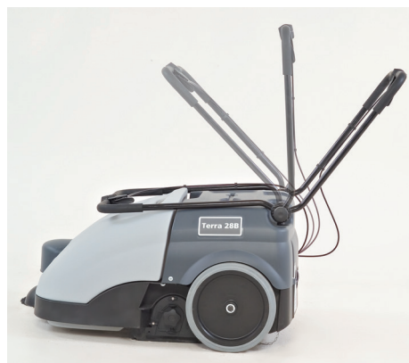
Adjustable handle folds for easy storage.