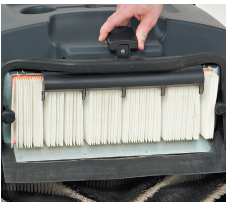
Filter shaker easily combs filter for cleaning. A well maintained filter will last for over 100 hours of operation.

Schools and Universities Hospitals / Healthcare Casinos Commercial Cleaning Facilities Health Clubs Office Buildings Airports / Train Stations / Bus Depots Hotels Government Buildings and Installations