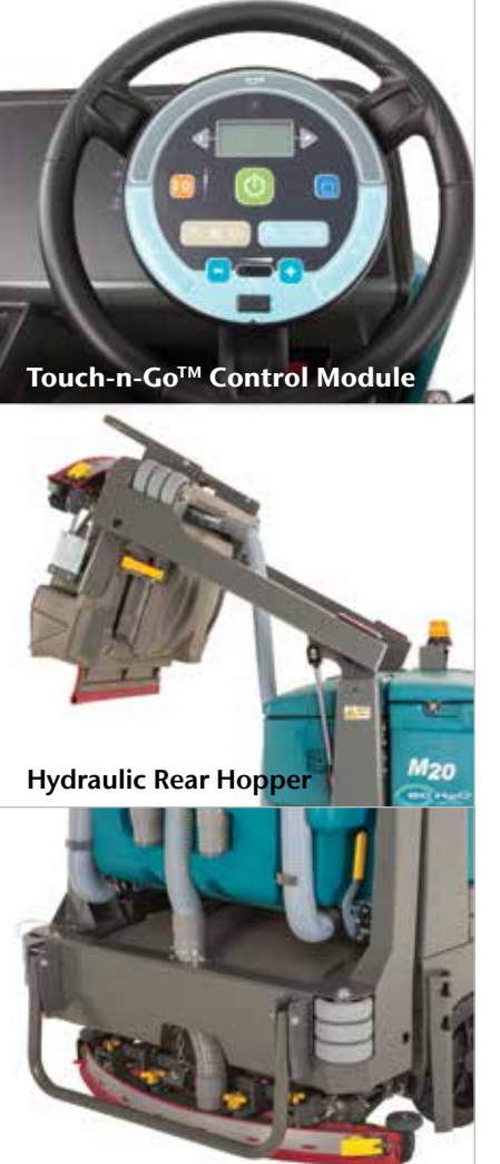
Dura-Track<sup>™</sup> Parabolic Squeegee