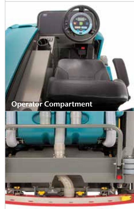
Yellow Maintenance Touch Points

Overhead guard protects operators from falling objects.